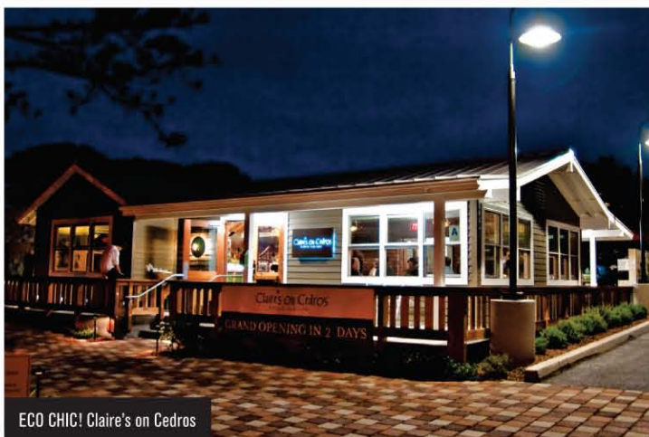
ECO CHIC! Claire's on Cedros

Forget Humvees—the ultimate fossil fuel hog is getting a Prius-like makeover and parking it in the S.D. marina. The U.S. Navy is getting onboard the enviro-agenda with the world's first hybrid amphibious assault ship, Makin Island. During its maiden voyage alone, the 847-foot vessel saved more than 900,000 gallons of gas. How's that for smooth sailing?