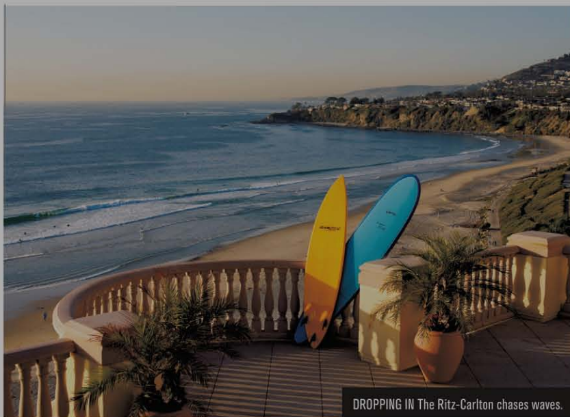
DROPPING IN The Ritz-Carlton chases waves.